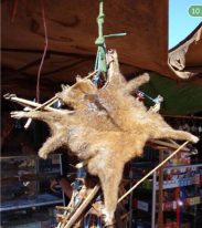
Pygmy Leek Nystrobus pygmaeus