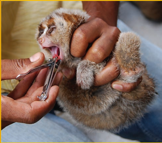
slow loris having its teeth removed (no anaesthetic!)