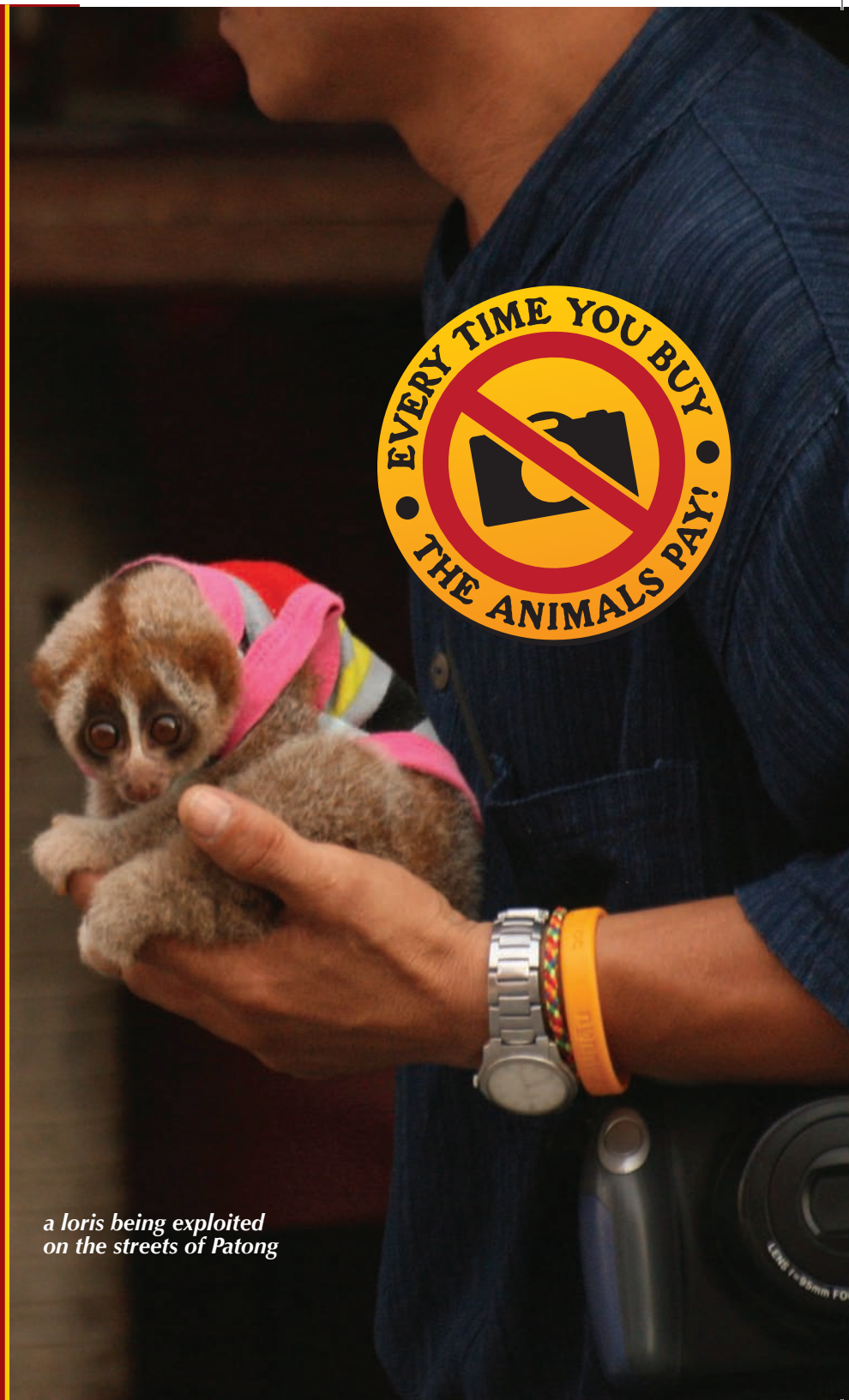
a loris being exploited on the streets of Patong