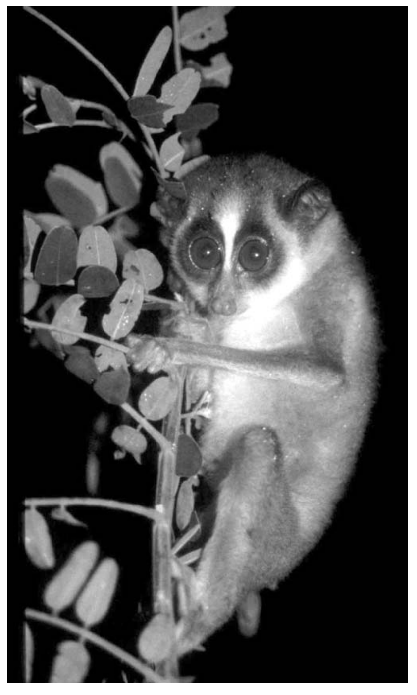
Fig. 2. The recently recognized Loris lydekkerianus nordicus occurs at higher densities than other loris taxa.