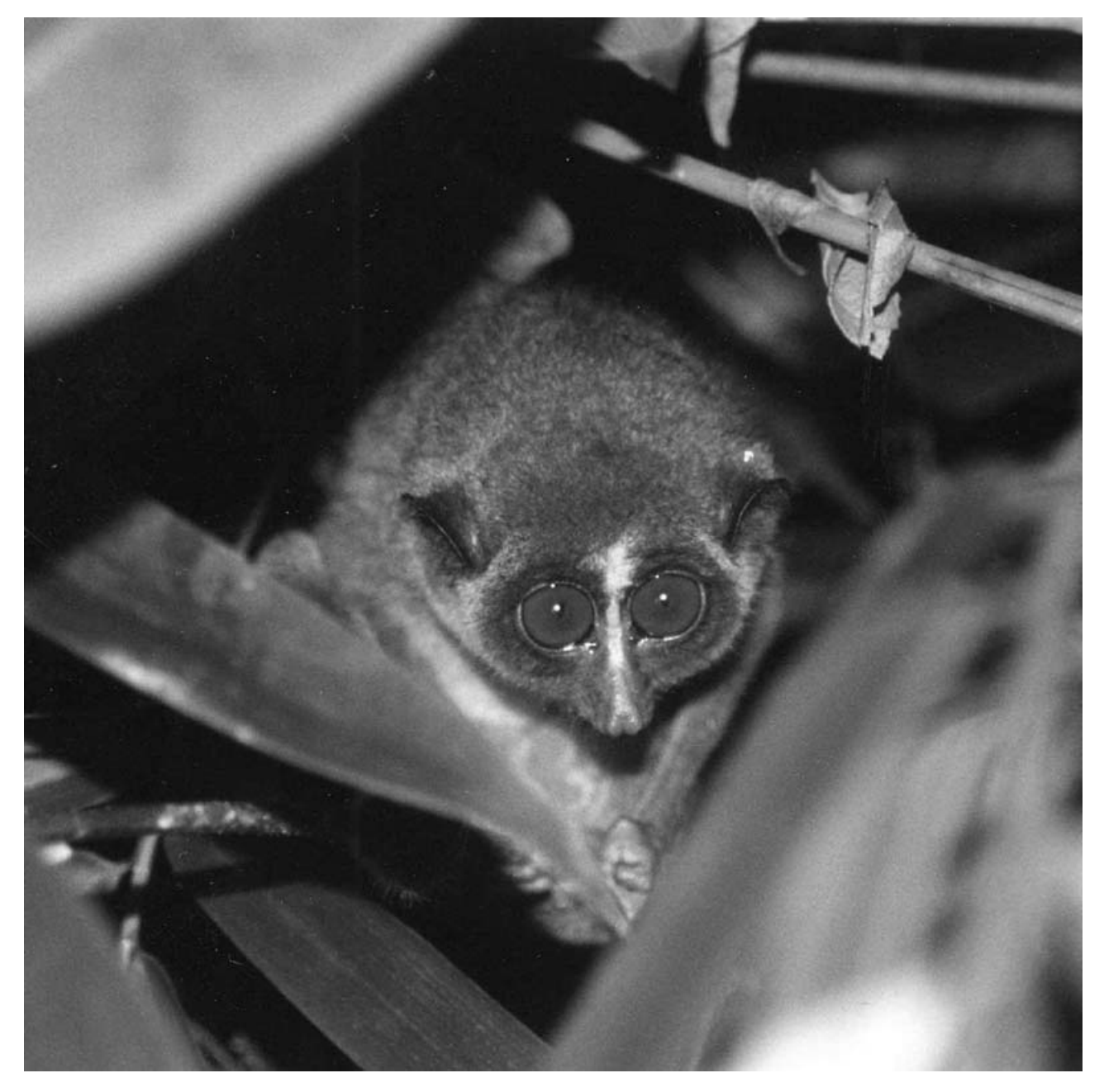
Fig. 3. Loris tardigradus tardigradus occurs at relatively low densities in isolated patches of the remnant south-western rainforests of Sri Lanka.

located in a 2-m high tree ( Neolitsea cassia ). We could see only the eyeshine of a second small mammal along another road in the park. Though the eyes were characteristic of a loris in size, shape, and colour, we cannot confirm with certainty that this animal was a loris. The former of these sightings is the first confirmed sighting of a slender loris in the Horton Plains National Park since 1937 (Nicholls, 1939), and is described in detail elsewhere (Nekaris, 2003 c ).